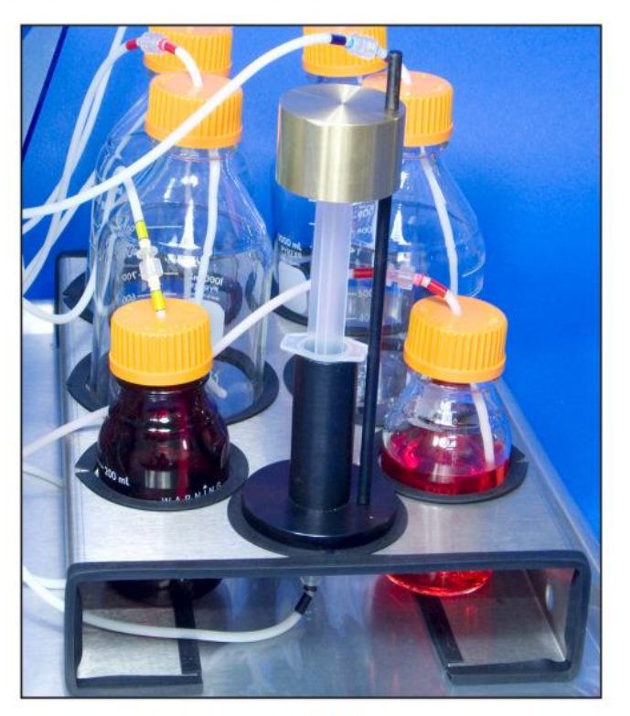
Figure 3: Syringe and holder ready for use.

4. After connecting the tube, gently guide the black rod through the hole in the brass block until it rests on the plunger.